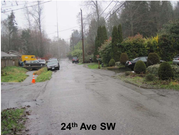
24 th Ave SW

On 24 th Ave SW – LOOK FOR US UNDER THE TENTS